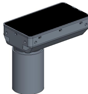
PLUS™ without trim ring